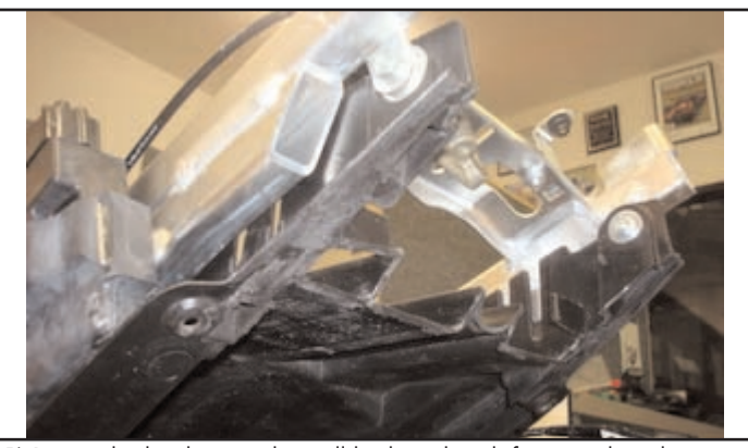
4) Re-attach glovebox, replace all bodywork with fasteners loosely installed. Install undertail left side first, then right side, be careful not to scratch, or crack undertail. Use plastic screw rivets to hold undertail in place. Insert lock into undertail using stock lock mounting clip, make sure the lock is in the correct position with the lock cable arm to function properly.